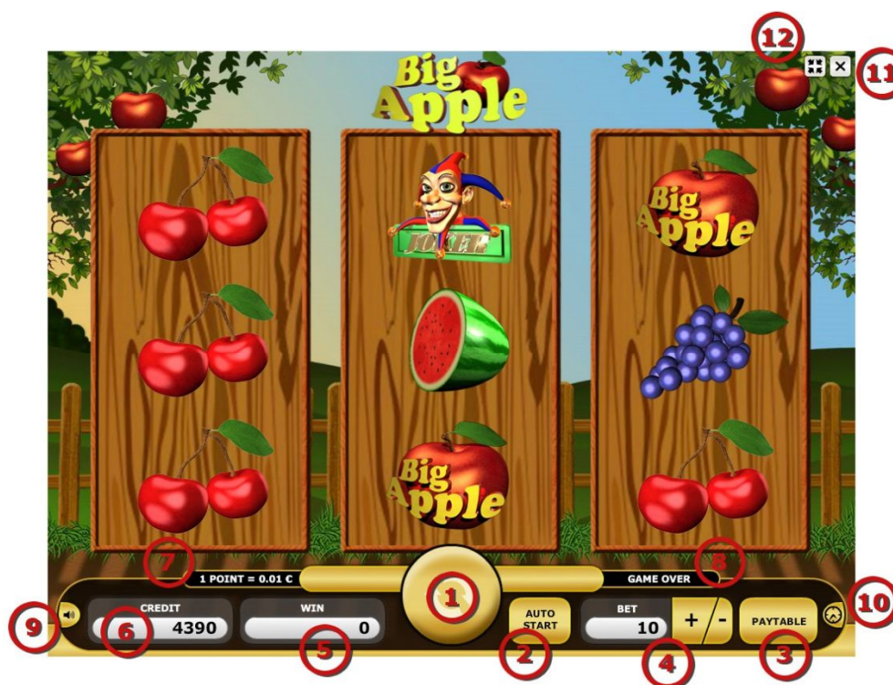
Figure 2: Example Screen of a Game with GUI elements.

The following picture shows an example screen of a game with all GUI elements. The GUI elements are either contained in the panel at the bottom of the screen or in the top right corner and they are the same in all games.