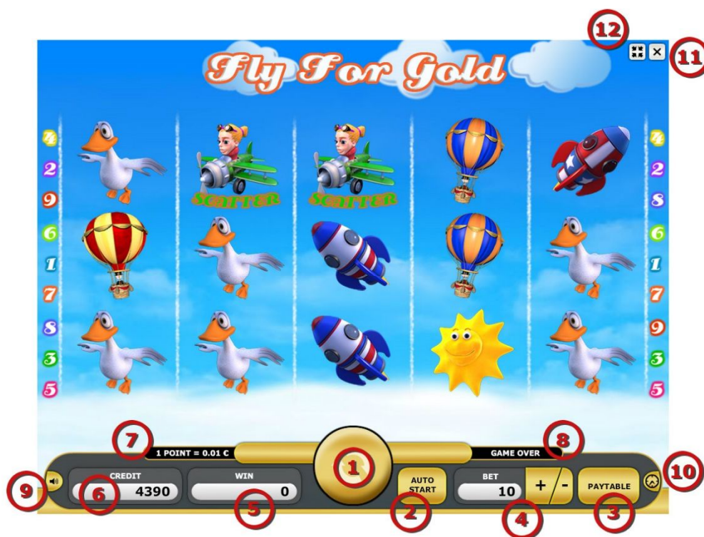
Figure 2: Example Screen of a Game with GUI elements.

The following list describes the function of all GUI elements shown in figure 2: