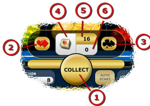
Figure 4: Screenshot of Gambling

The following image shows a screenshot of gambling: