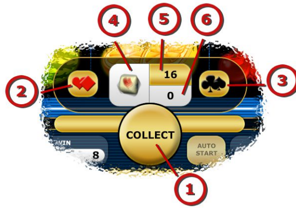
Figure 4: Screenshot of Gambling

The following list explains the GUI elements of the gambling shown in the screenshot in figure 4: