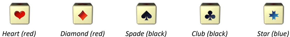
Figure 3: Symbols of Gambling

The following symbols are possible outcomes of the game: