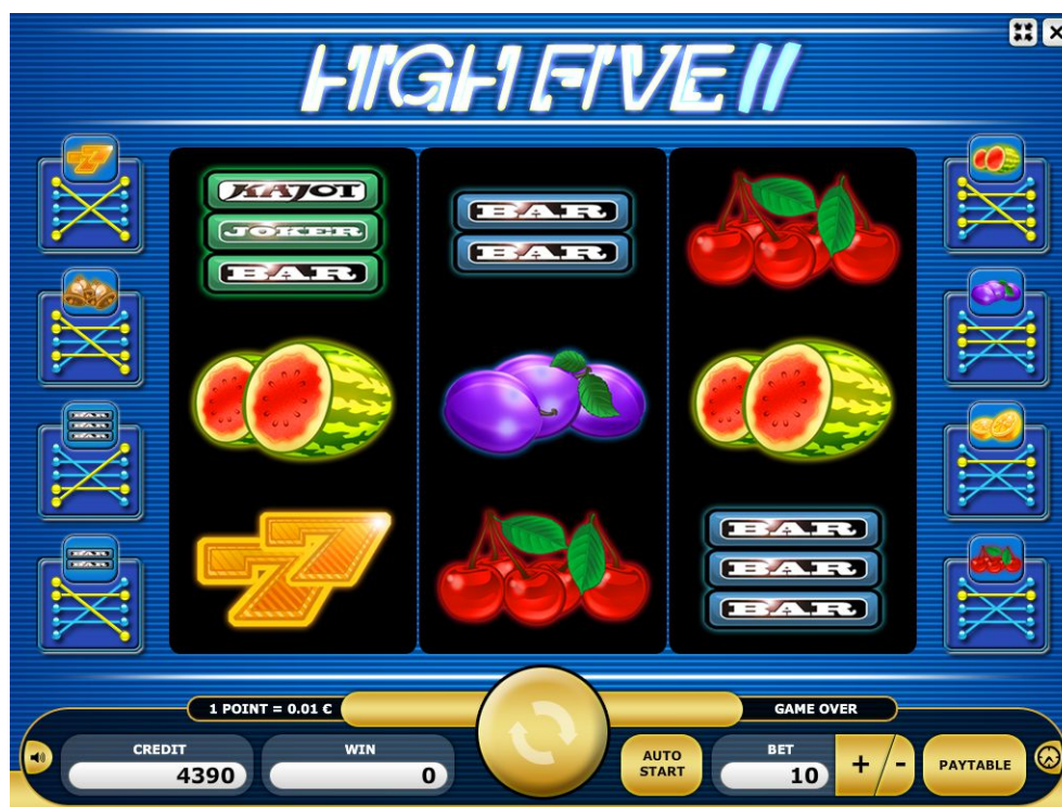
Figure 1: Screenshot of High Five II

The following image shows a screenshot of the game: