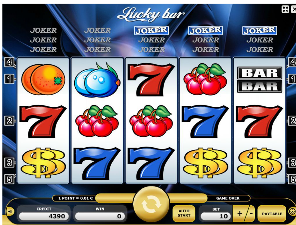
Figure 1: Screenshot of Lucky Bar

The following image shows a screenshot of the game: