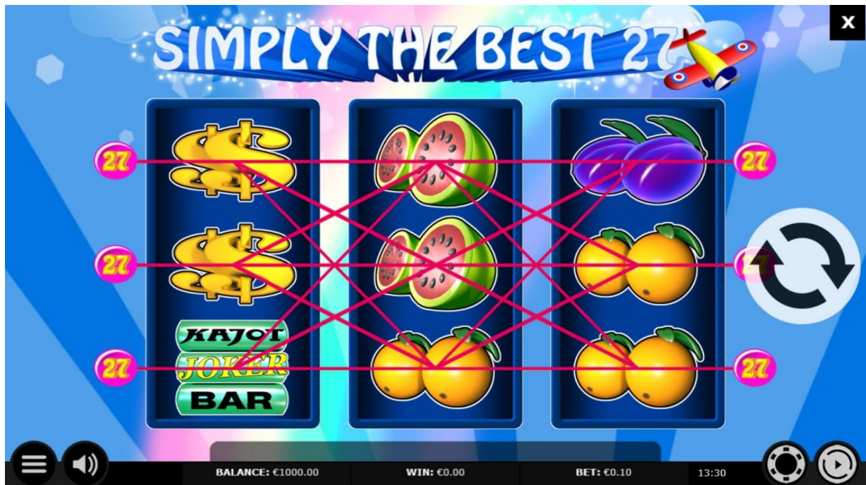
Figure 1: Screenshot of Simply the Best 27 Go

The following image shows a screenshot of the game: