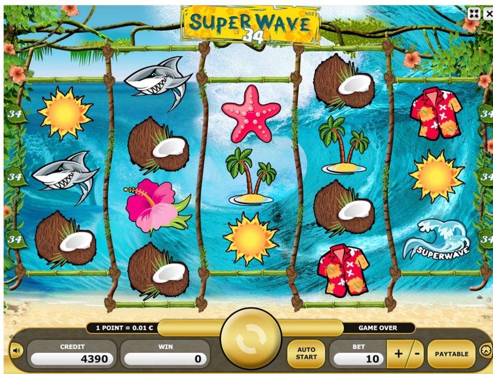
Figure 1: Screenshot of Superwave 34

The following image shows a screenshot of the game: