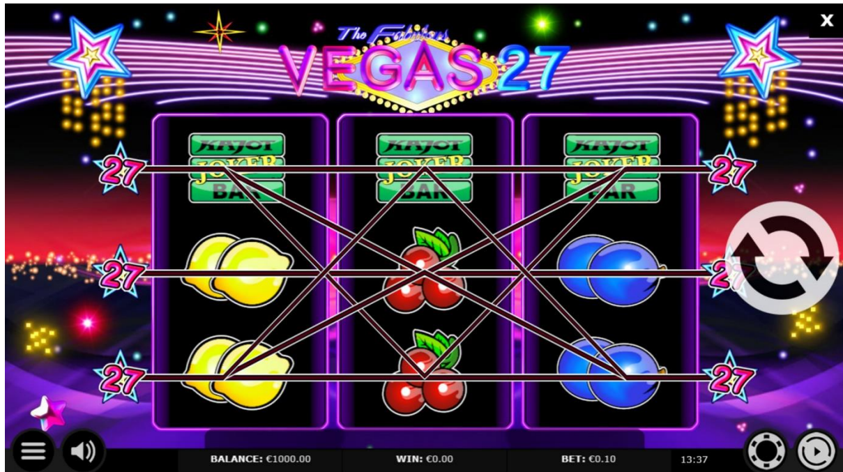
Figure 1: Screenshot of Vegas 27 Go

The following image shows a screenshot of the game: